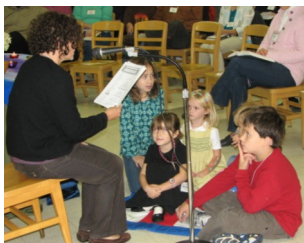
Story for all Ages.

The Fellowship has three themes that guide curriculum choices for all age levels in its religious exploration program.