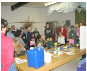
Learning about refugee camps in Darfur.

Adults join the youth on Wednesday evenings for an all member and friend dinner and classes/activities. Dinner starts at 5:30 PM.